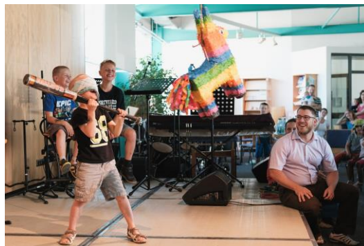
(Piñata filled with goodies)

In the afternoon, we had lunch together and a little program was done for us. The boys enjoyed hitting the Piñata, for this is not usually a common game in Germany.